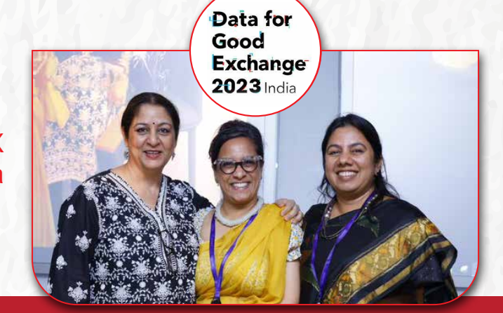
Speaker at D4GX 2023 India