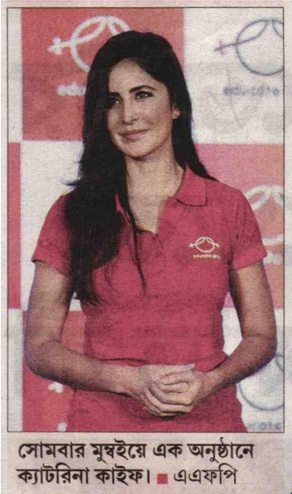
ABP Abela (Kolkata)